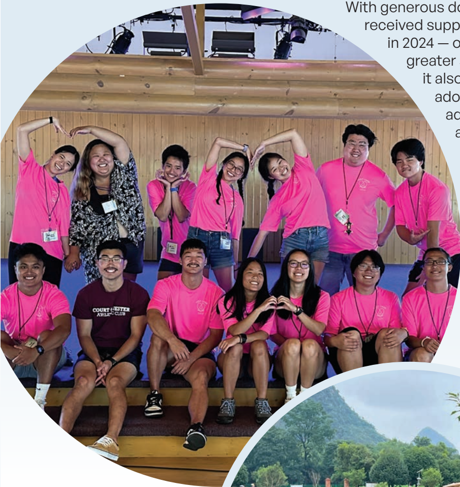
Top: The Holt Adoptee Camp staff in New Jersey brought all the smiles!